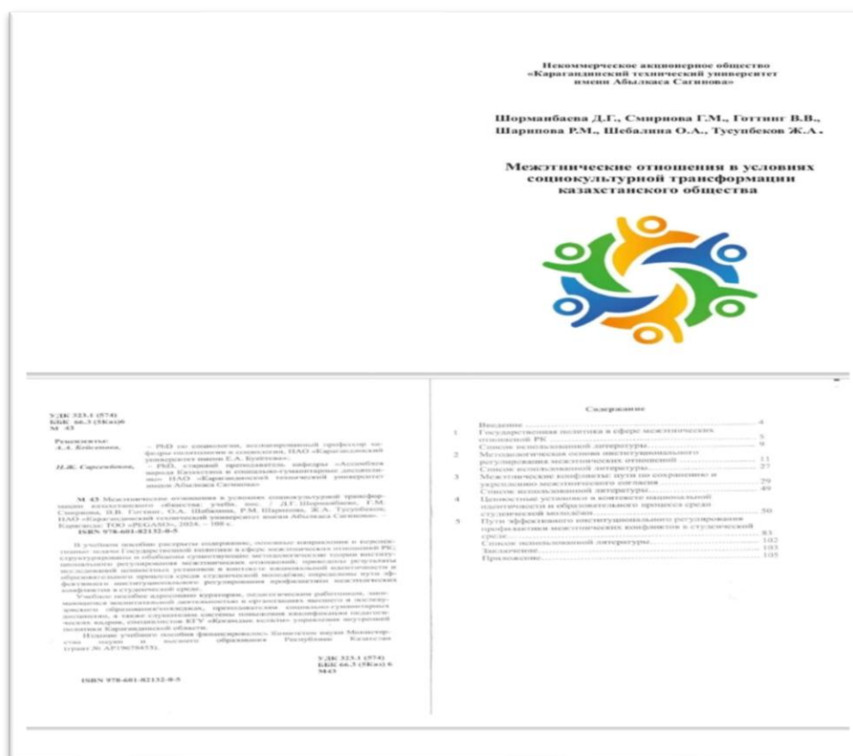
Figure 3 – Tutorial "Interethnic relations in the context of socio-cultural transformation of Kazakhstani society"