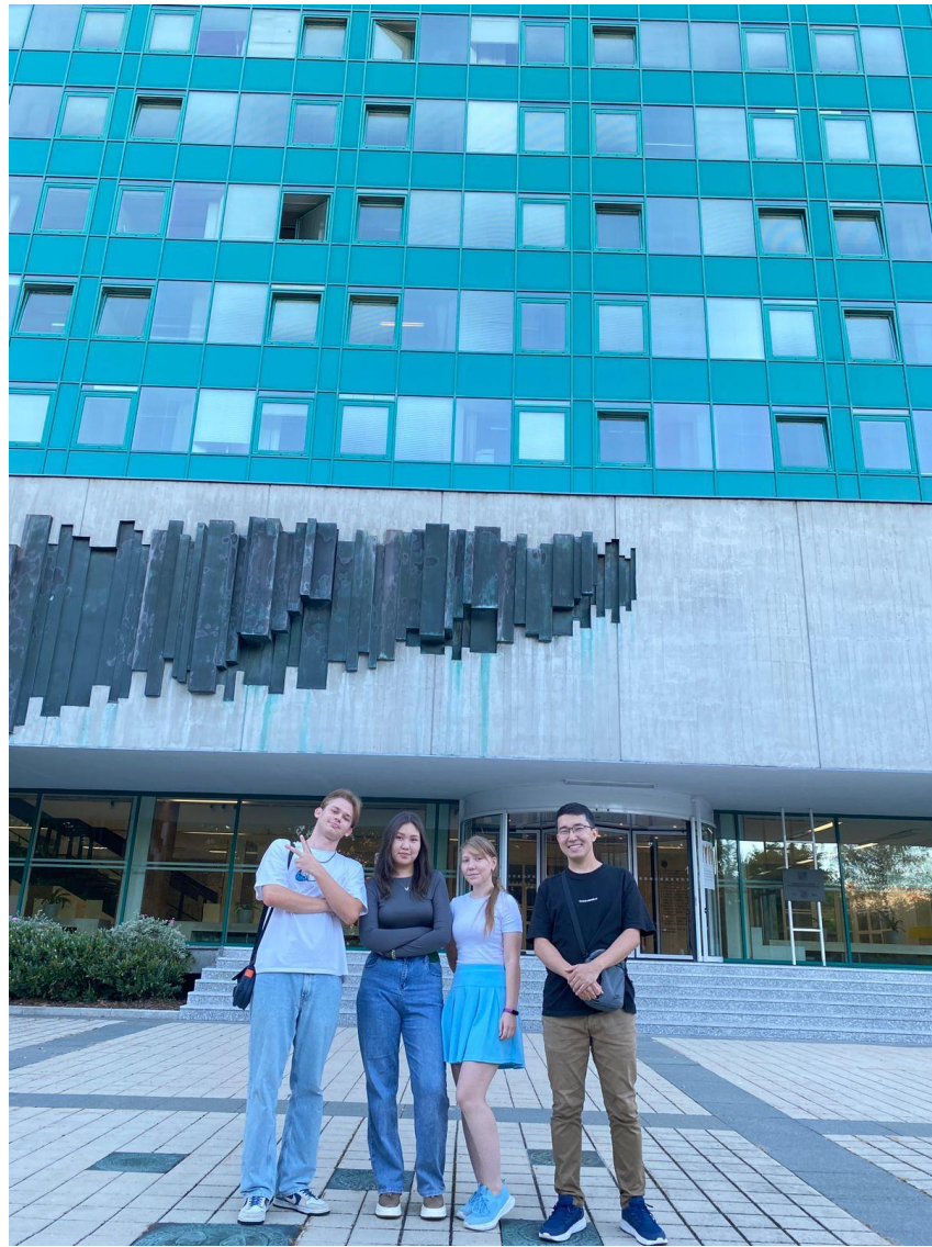
Students of the Department of «Building Materials and Technologies» at the Ostrava Technical University in front of the main building of the University