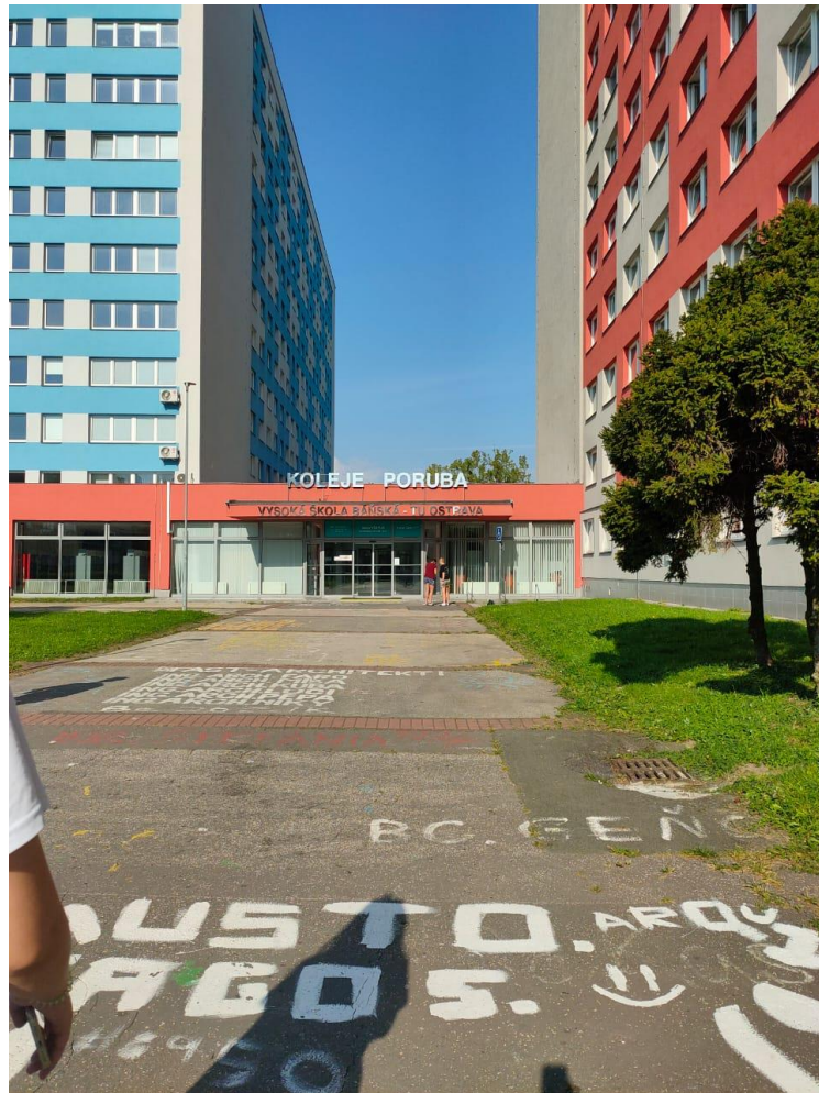
The hostel of the Ostrava Technical University