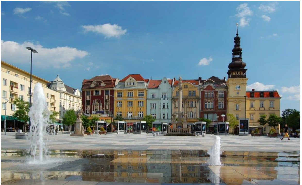
The area of Ostrava